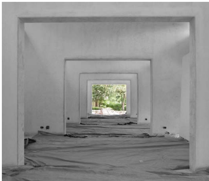
Studios for the Davidoff International Art Residency at Altos de Chavón School of Design, La Romana, Dominican Republic.

Basel, Switzerland, October 7, 2014 - The Davidoff Art Initiative in collaboration with Altos de Chavón School of Design is pleased to announce the first five international artists who will participate in the Davidoff International Art Residency at the newly built residency facilities at Altos de Chavón School of Design in La Romana, Dominican Republic, from January 18 to April 5, 2015 .